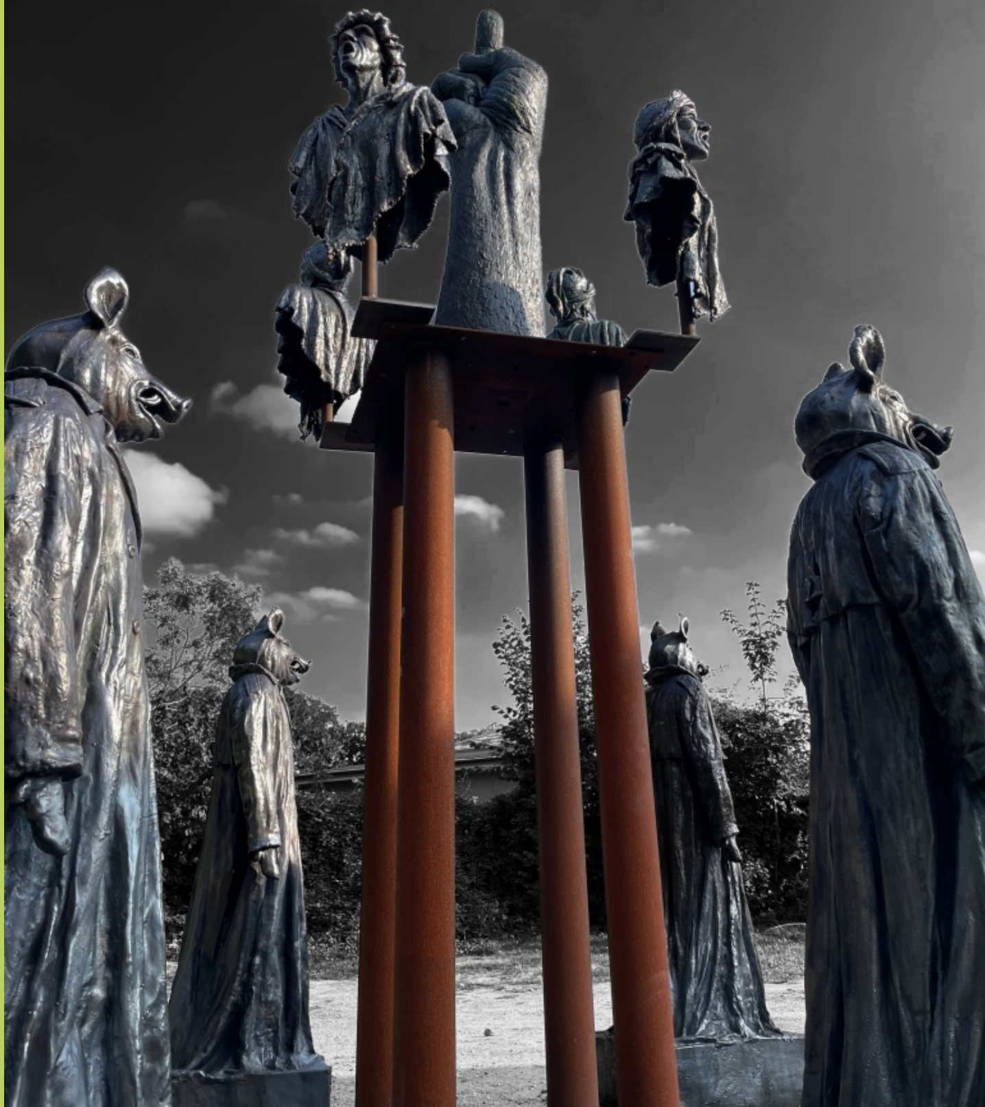
Photo: " Save Dante - Fuck Q Park's parking garage " Art installation 2021 , copper. Artist Jens Galschiot

Unveiling will be held Monday the 13th September 2021. 17.00 o'clock Dantes plads. 1556 Copenhagen.