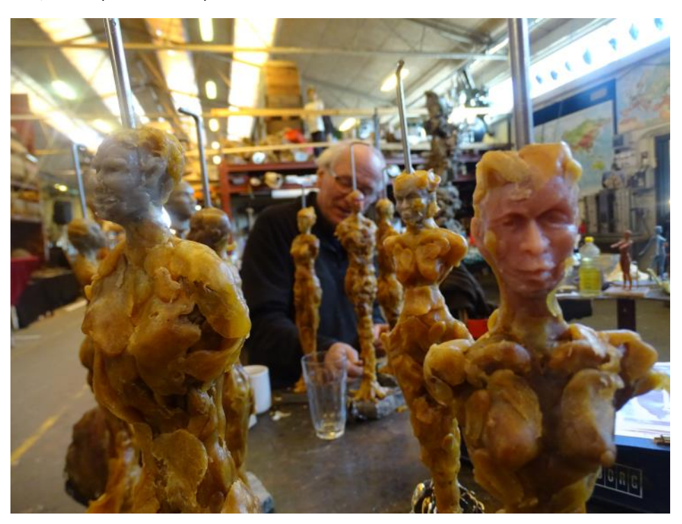
Sold with massive crowdfunding discount!

The sculptures included in crowdfunding are a further development of Galschiot's great art installation, "Homo Sapiens", which is described in this file. He has made over 100 original and unique sculptures - models in 1/6 size (30 to 40 cm).